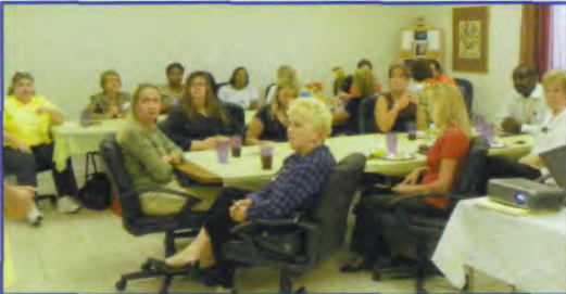
Pictured: Lunch & Learn Attendees

The Anson County Chamber of merce had a Lunch and Learn on ember 25th sponsored by Anson million Americans are providing unpaid