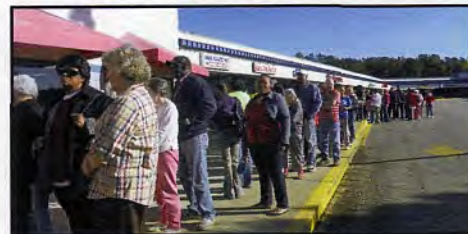
The first 150 customers received a free tote bag as part of the grand opening celebration!