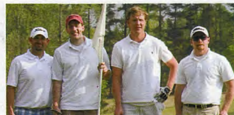
Ambassador Health & Rehab of Wadesboro Team, 3rd place