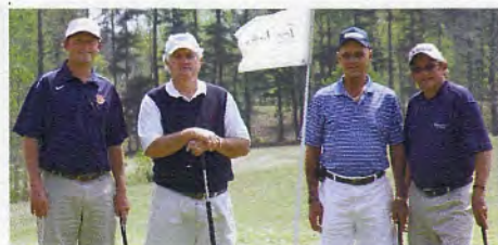
Wadesboro Tire Team, 2nd place