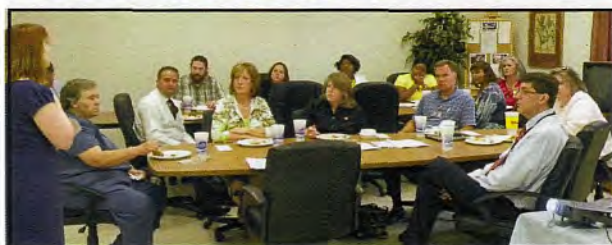
Pictured above: Lunch & Learn Attendees

The second Lunch & Learn held at the Chamber was sponsored by Anson County Job Link Center. Titled, "What