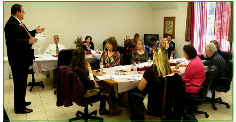
Attendees of the Lunch & Learn

For more information on upcoming Lunch & Learnøs please call the Chamber at 704-694-4181 or email ansonchamber@windstream.net.