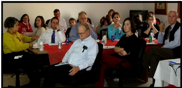
Attendees of the Lunch & Learn

A handout was given to all in attendance that went along with the presentation. There were six topics discussed which included Freeze Claims, Copper Theft, 15