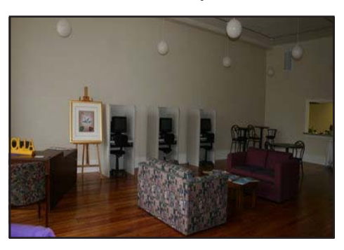
Interior shot of the Morven HOLLA! Community Center

Article & Photo courtesy of Anson Record