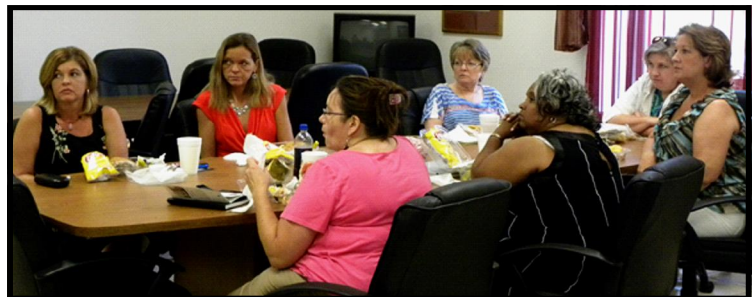
Attendees of the Lunch & Learn

The Chamber's next Lunch & Learn is scheduled for Tuesday, September 17 th with Carolinas Healthcare System. Please contact the Chamber of Commerce at 704-694-4181 or ansonchamber@windstream.net to attend.