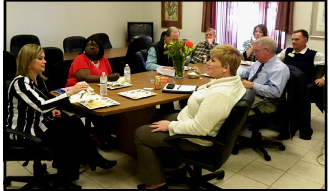
Attendees of the Lunch & Learn