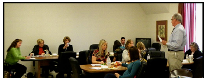
Attendees of the Lunch & Learn

The Chamber and SPCC's Small Business Center have planned another Lunch & Learn for May 7 th . If there is a topic you would like to learn more about, please contact the Chamber of Commerce at 704-694-4181 and we will bring it to you in the near future.